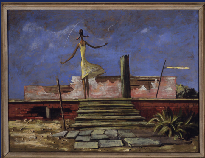
Hughie Lee-Smith, Untitled , 1951, oil on masonite

MUSEUM TOURS are provided to you at NO COST and are available before or after performances at Smothers Theatre, or at specially arranged times. Regular museum hours are 11 AM to 5 PM, Wednesday through Sunday. Please call 310.506.4766 to reserve a tour. Space in the museum is limited.