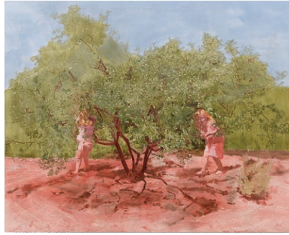
Left: Lucas Reiner, Station XI - Crucifixion , 2010, drypoint, aquatint, spitbite, and etching on paper, from a portfolio of 15 prints. Courtesy of Bridge Projects. Right: Patty Wickman, Circumscribe , 2017–2019, oil on linen. Courtesy of Bridge Projects.