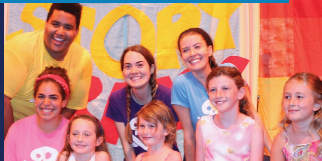
Student writers with the cast of Story Pirates

Marc Cohn returns to Smothers Theatre and the Andy Warhol: Life & Legends exhibition opens at the Frederick R. Weisman Museum of Art.